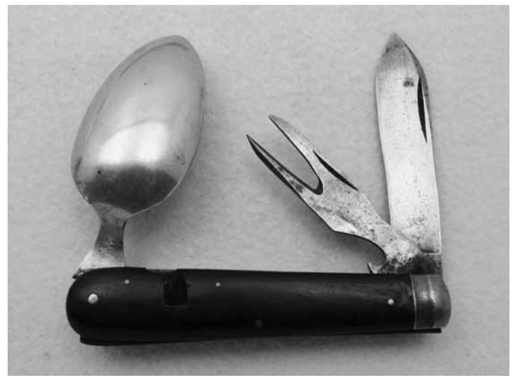
Ulster Knife Co - This slip apart knife has three functions in the one blade. It is a two tine fork, a can opener and a crown cap opener. A little trivia is that the invention of the crown cap was 1891, and the Ulster name started in 1876.

also a suggestion that hobo is short for ho pping bo xcars, and some maintain