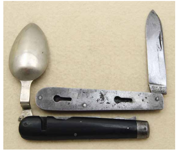
New York Knife Co - Walden N.Y. - This slip apart is distinctive; the spoon has a 90 degree bend to accommodate the slot in the handle when closed. All others have a sweeping bend to accomplish the same thing.

A. F. Bannister American Knife Co. Plymouth A. W. Wadsworth Brantford Cutlery Camillus Cattaraugus Colonial C. X. Lockwood Brothers Empire Knife Co. Enterprise Cutlery