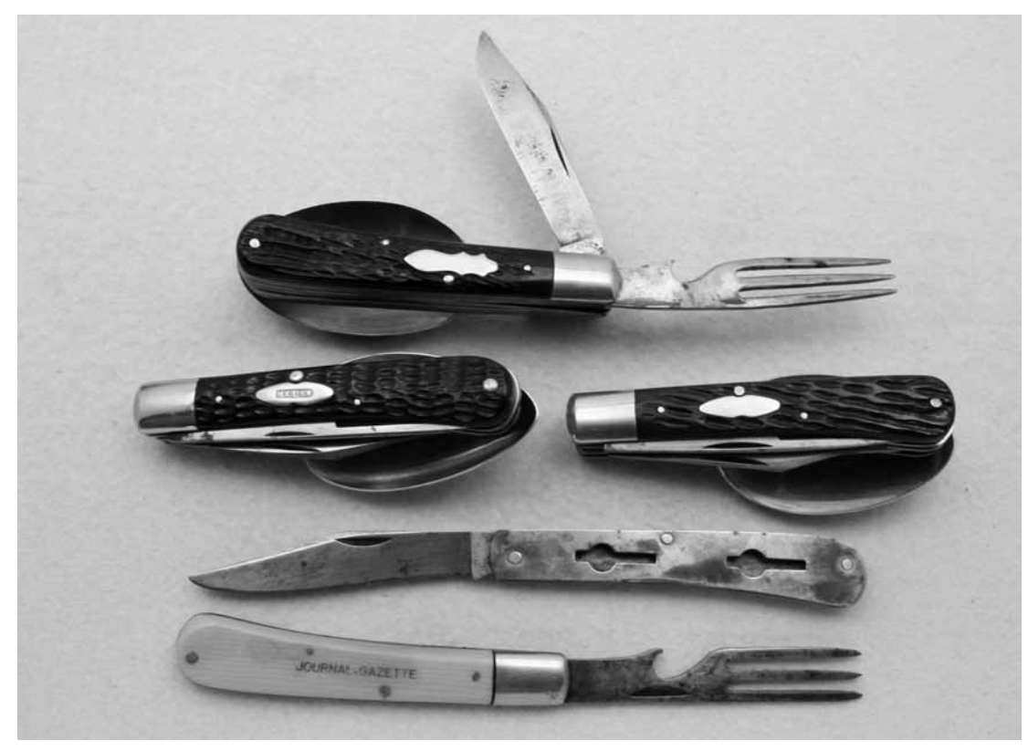
From the top: Ka-Bar, Union Cutlery, Ulery and Cattaraugus. Cracks in the handle material are common on these pattern hobo knives. The first place to look is the cutout where the spoon rests. A used tool is going to show the ravages of abuse and misuse. Note the shields on these 3-3/4" size sets. The advertising on the Cattaraugus is unusual as few eating sets were used for give away or advertising. Too expensive.

Homeward Bound or Homeless Body. There's Continued on page 15