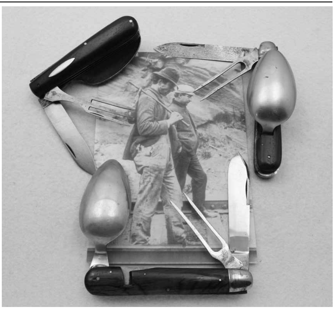
Clockwise from 10 o'clock - Brantford Cutlery Co. has a three tine fork, a shield, no bolster and does not slip apart; Robeson Shuredge and Terrier Cutlery have a safety feature which only allows the blades to slip apart when the main blade is open.

Just for clarification, the tabs that are in the center area of the liner have a male tab/pin that fits into a keyhole female opening in the corresponding liner. The slip movement puts the male tab in the narrow portion of the keyhole thus securing each tool to make it as one. The earlier hobo knives had a steel pin in the steel liner with a flared head. Early specimens can also be found with a copper or brass pin. In 1907 a