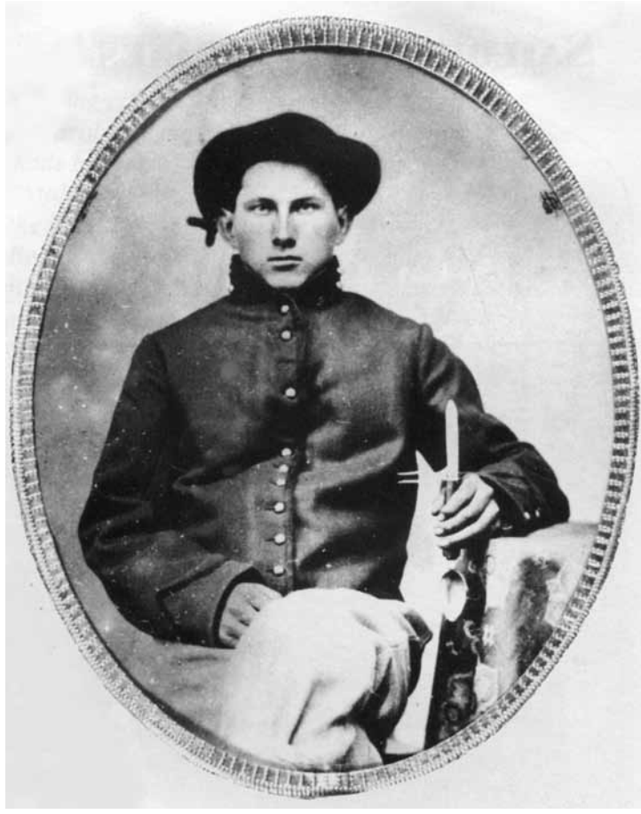
The tools of the American Civil War. Knife, fork & spoon.

Winsted CT - 1856 Geo Kay Esopus NY - 1860 Holley Mfg. Co. Lakeville CT - 1854 J. Ward Bronxville NY 1860 Lamson & Goodnow MA - 1853 Continued on page 29