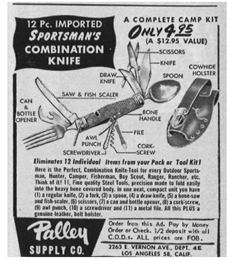
In 1955 this ad appeared and, from the number I have seen of this eating set, I would say that a hundert bazillion were sold. They were indeed a novelty knife but not too much on practical functionality methinks. On a collector's market I do not think they have appreciated much past the 1955 price.

The term hobo knives doesn't accurately apply to the period of time from 1861-1865, as the term hobo was derived around the turn of the century. Another fact was that the knives of this period were not issued by the military so each soldier that had one during the war either purchased it individually or it was given to them. And then the question was raised as to which of the cutlery companies could have possibly manufactured these during this conflict. The following list is comprised of companies that started business prior to the Civil War and that made knife, fork and spoon eating utensils. I have specimens of several of these companies or I have been shown photographs to substantiate that these products were made by these companies. Whether they were made and sold during the Civil War is a tough thing to prove, but they could have been. In the research I was doing on the Civil War I came across a