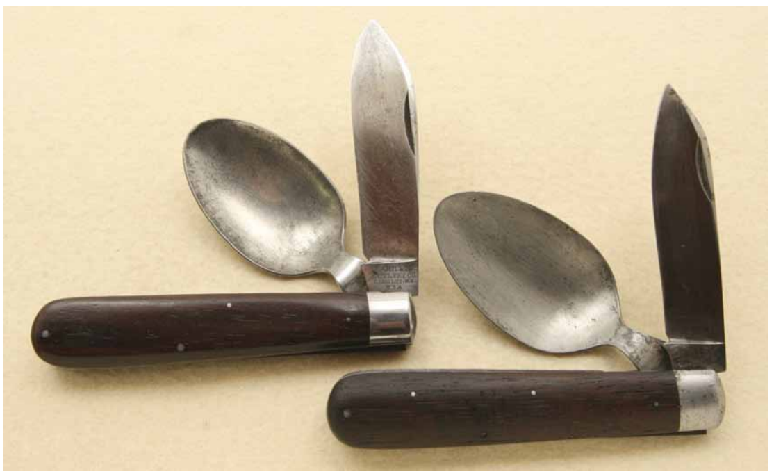
On the left is a Camillus Cutlery with its counterpart of a Holley. Both are 4-1/2" in length (closed) with cocobolo handles and do not come apart.

Frenzel Geo Kay Hart Cutlery Holley Hollingsworth J. Ward