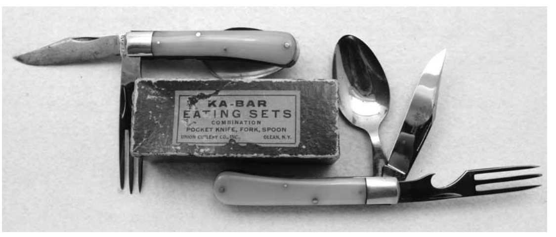
These 3-3/4" celluloid handle slip apart eating sets were popular in the 1930s and early 1940s. In addition to general sales they were endorsed and marketed by the Boy Scouts of America and the Camp Fire Girls. The Girl Scouts did not offer these sets. The scouting organizations did not offer these in other than celluloid, but bone was available for general sales.

that hobo is short for Hobo ken, NJ, where many rail lines converged in the