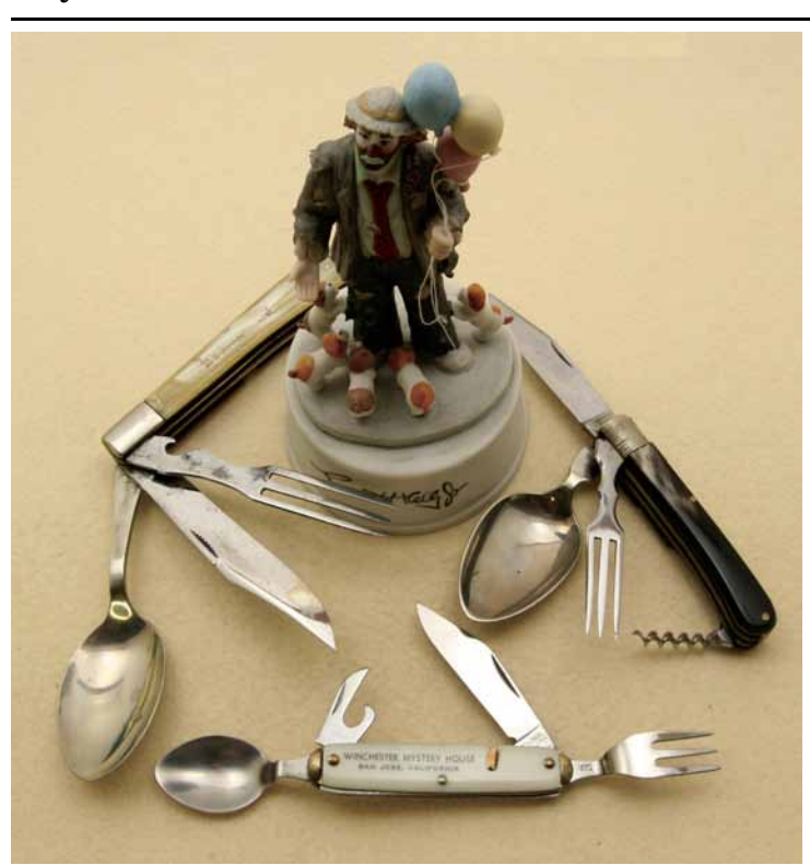
Clockwise from 10 o'clock - Ka-Bar 5-1/4" "Sportsman" - A.W. Wadsworth, horn handles with corkscrew - Colonial souvenir knife from the Winchester House in California. Not a slip apart.

on camp/picnic knives that were used for spreading and cutting. Forks can either be two tine or three tine and sometimes, but rarely, four tine. Then there is the spoon which is generally plated or made of nickel silver, providing corrosion resistance. Some models have a caplifter/can opener blade, and others are equipped with a corkscrew. The older hobo knives have steel liners and later knives have brass and nickel silver liners. That pretty much covers hardware variations on a theme on the construction of these knives. The other point to make is that large majority of pre-1920s hobo knives