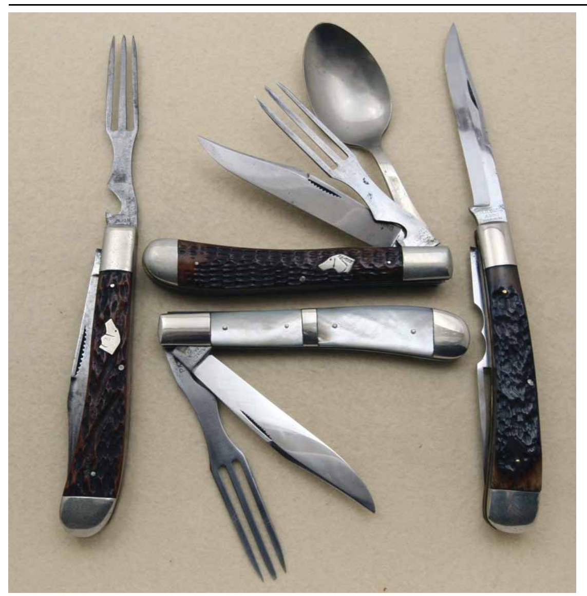
Clockwise from 9 o'clock - Union Cut Co., Ka-Bar, W.R. Case and Union Cut Co. All of these style knives use the three tine forks with crown cap lifters and have nickel silver or brass liners. The three part 5-1/4" hobo knives with spoons are a little more difficult to find in good specimens.

Continued from page 15 place needed items in packages to be sent to the soldiers in Europe during Christmas of 1917. However the Red Cross never purchased these knives nor did they purchase the socks and handkerchiefs, papers and pencils, and other needed items destined for the soldiers stationed in France. All were a product of donation drives which had been organized by the Red Cross.